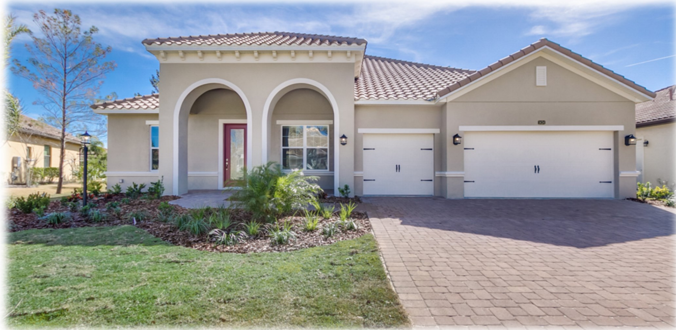
Floor plan and elevation renderings only. Subject to change without notice. Information deemed accurate but not guaranteed.