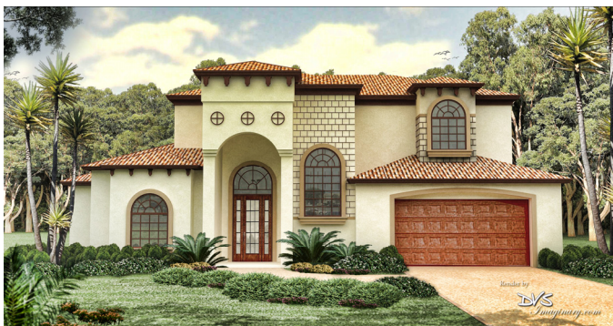
*Artist's Rendering Only; See specific plans for elevations